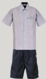
CARGO SHORT WITH SHIRT