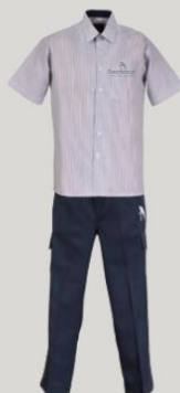
CARGO TROUSER WITH SHIRT