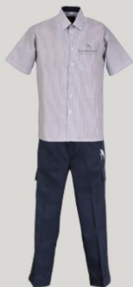
CARGO TROUSER WITH SHIRT