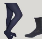
PLAIN NAVY CREW SOCK OR STOCKINGS