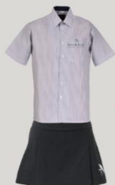
SKIRT WITH SHIRT